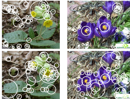
Figure 1: Top row: Laplacian-of-Gaussian and Harris Laplace based on luminance. Bottom row: Laplacian-of-Gaussian and Harris Laplace based on color boosting. The color boosted detector focuses on the more informative features. Only the fifty strongest detected regions are depicted. The radius of the circles indicates the scale selected.

The aim of feature detection is to find discriminative regions in images. Most existing methods only use the shape saliency as a criterion for detection, which is extracted from the luminance information. However the use of color information could lead to the detection of