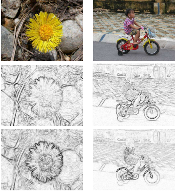
Figure 3: Comparison for edge detection. Top row: Original images. Middle row: RGB color edges. Bottom row: color-boosted edges. RGB edges are more biased by luminance.

proach to extend existing detectors to color is to compute the derivatives of each channel separately and then combine the partial results. However, combining the first derivatives with a simple addition of the separate channels results in cancellation in the case of opposing vectors, and the same situation occurs for second-derivative operators. To overcome this problem, Di Zenzo [13] proposed the color tensor defined as