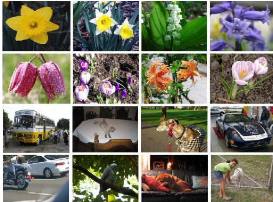
Figure 4: Example from the two data sets The top two rows show images from the Flower data set and the bottom two rows provide examples from the Pascal VOC 2009 data set.

Implementation Details: In our experiments we use the detectors proposed in section 2 together with a multi-scale Grid. The SIFT descriptor is used to create a shape vocabulary and the Color Names and HUE descriptors are used to create color vocabularies. We abbreviate our results with the notation convention CA (descriptor cue, attention cues) where CA stands for Color Attention based bag-of-words. In our experiments we use a standard nonlinear SVM with a \chi^2 kernel for the Flower data set and intersection kernel [4] for the Pascal VOC 2009 data set since it requires significantly less computational time, while providing performance similar to that using a \chi^2 kernel. We tested our approach on two different and challenging data sets,